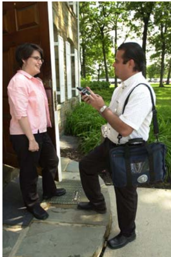
Hard to reach areas will have forms left at the home.