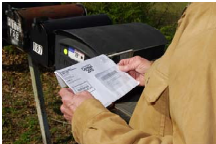
Most census forms will arrive in the mail, prominently displaying the "Census 2010" logo