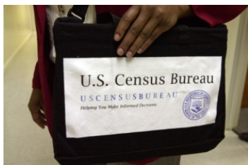
Many census workers carry U.S. Census Bureau bags, making them easier to identify